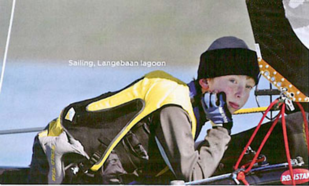
Sailing, Langebaan lagoon