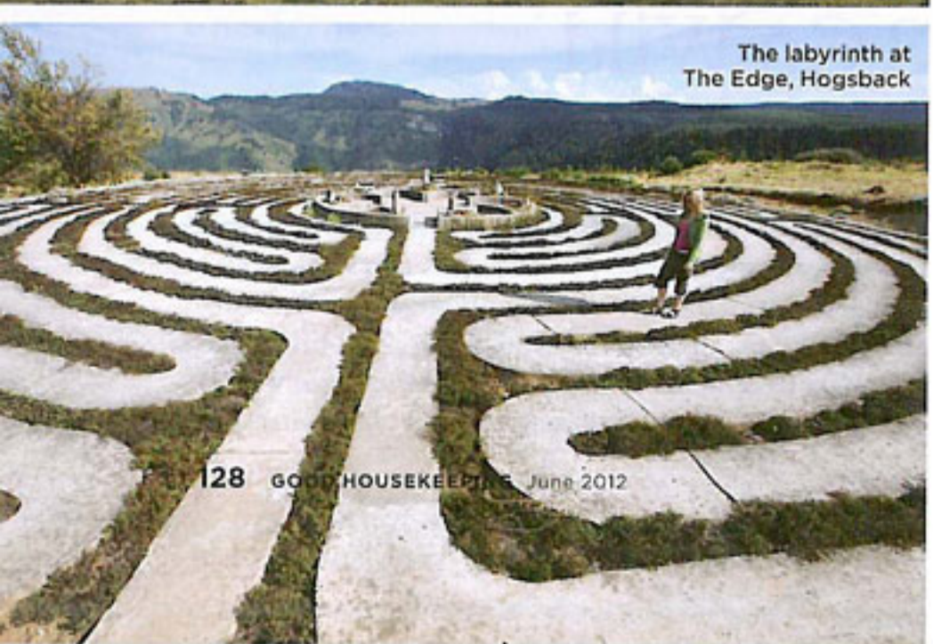
The labyrinth at The Edge, Hogsback

destination: the overwhelmingly warm and friendly staff, an entertainment team organising endless exciting activities – from outings to mangrove swamps to dune-surfing – and (a huge bonus for families with young kids!) lovely baby-sitters. Of course, there's a lot for active adults to do if reading a book on your balcony is not enough to keep you occupied.