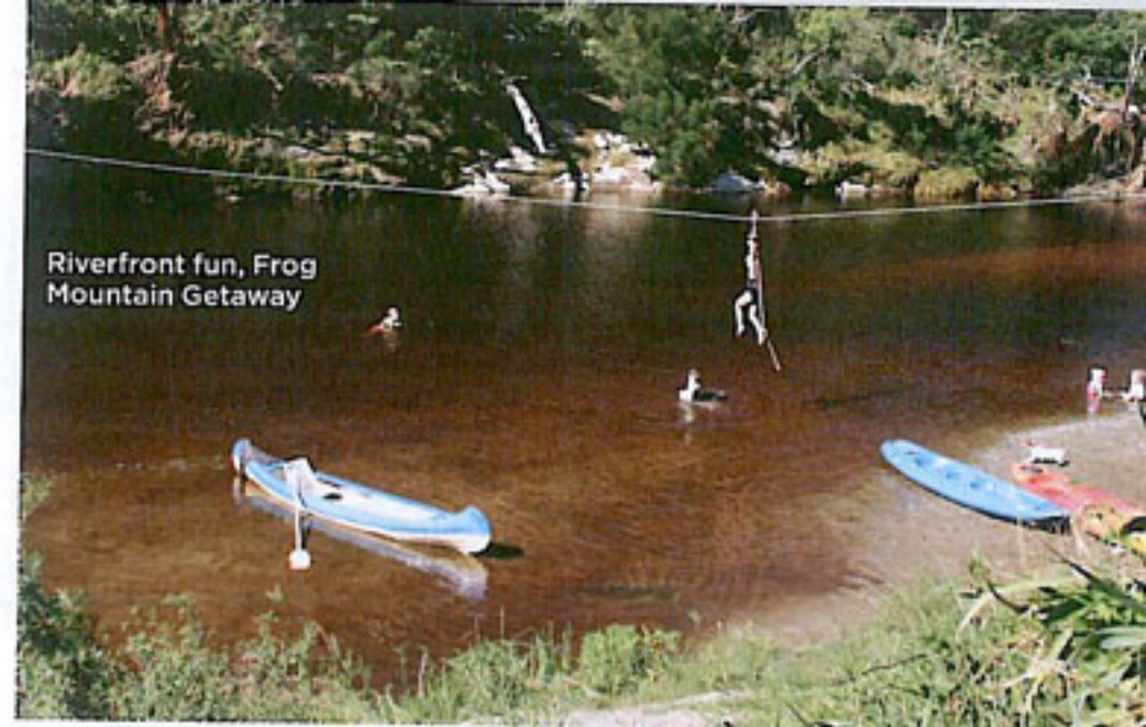
Riverfront fun, Frog Mountain Getaway

DETAILS Rates are per rondavel per night on weekends and during school holidays (R650 during low season and R950 in high season). Find Frog Mountain Getaway →