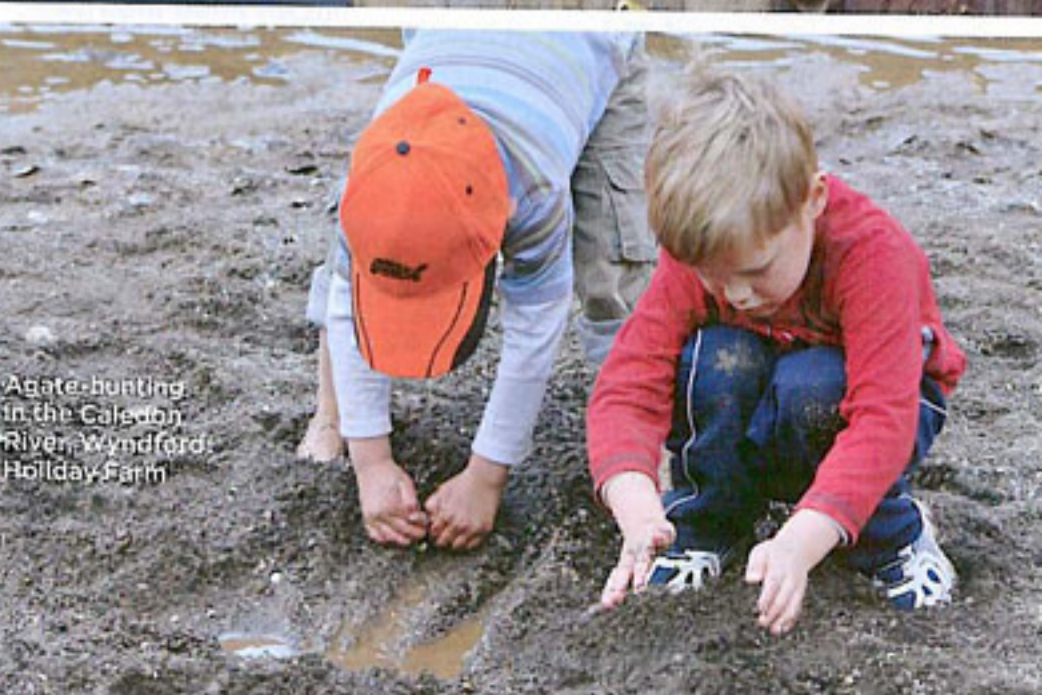
Agate hunting in the Caledon River, Wyndford Holiday Farm